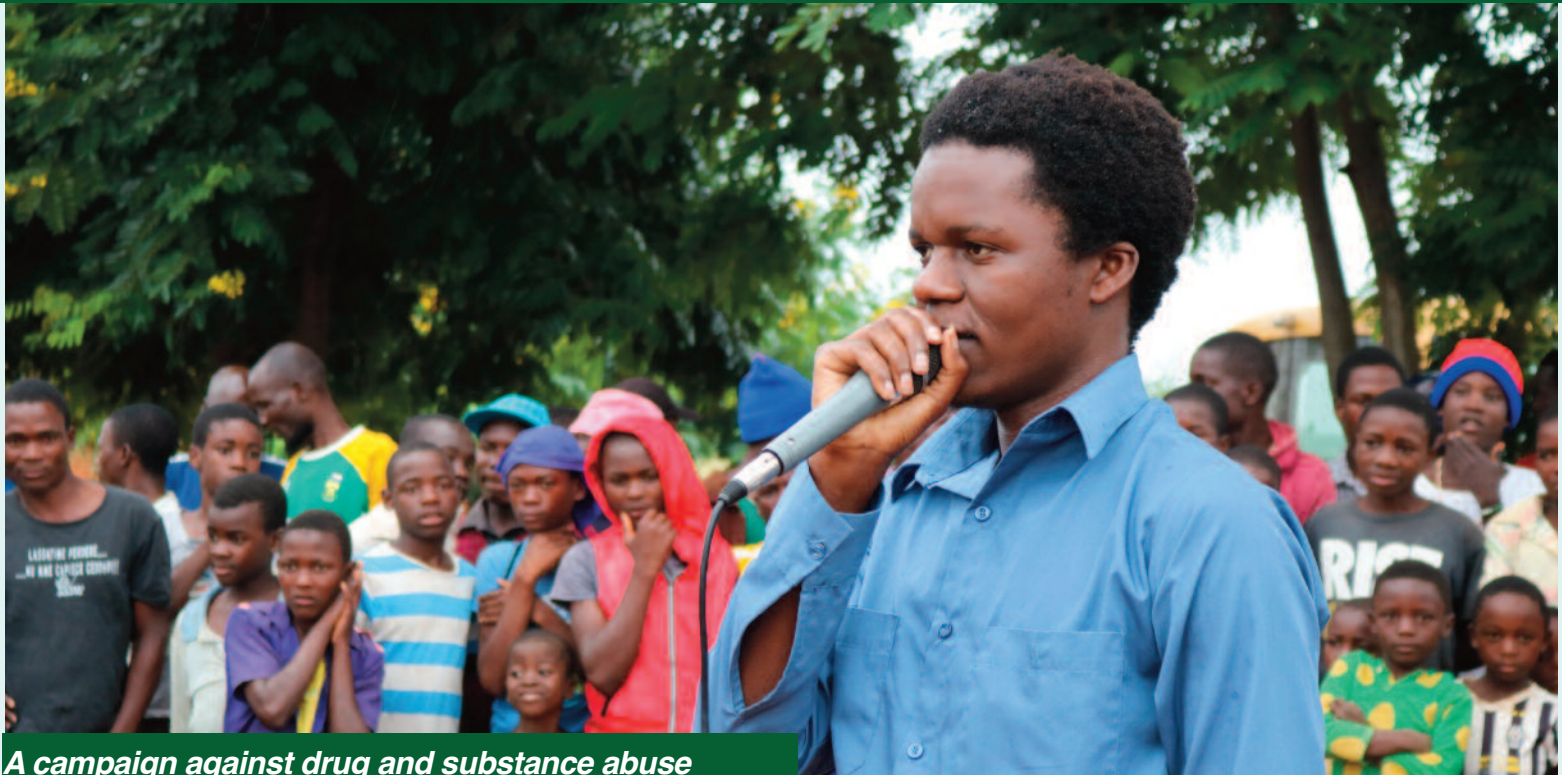
A campaign against drug and substance abuse

YONECO has reached over 200 learners at Zulu Primary School in Mchinji district with awareness messages on drug and substance abuse.