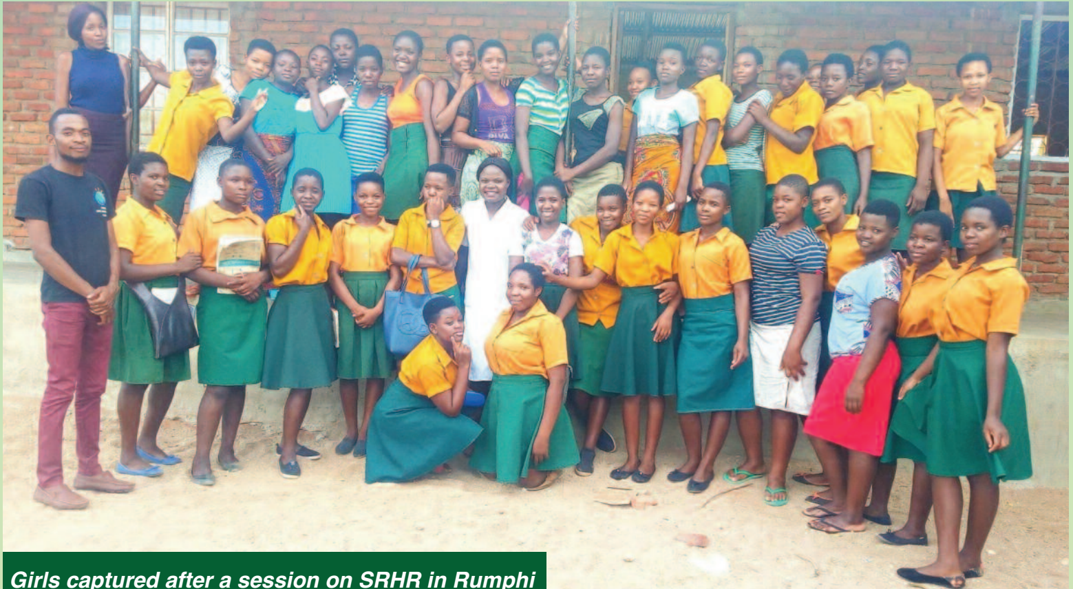
Girls captured after a session on SRHR in Rumphi

YONECO has reached to over 1000 students in Rumphi district with Sexual Reproductive Health and Rights (SRHR) information.