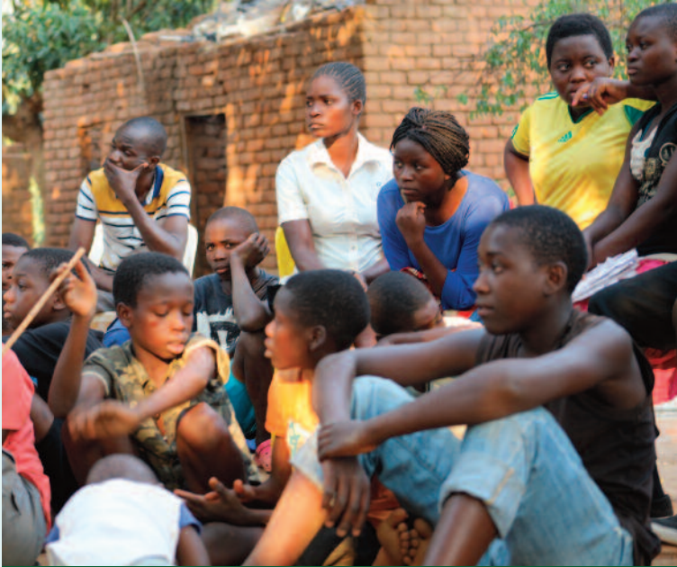
An orientation session on drug and substance abuse

YONECO conducted sessions on drug and substance abuse with the youth who patronize its Drop-in-Centre in Rumphi district, in its quest to deal with the rampant cases that are registered every week.