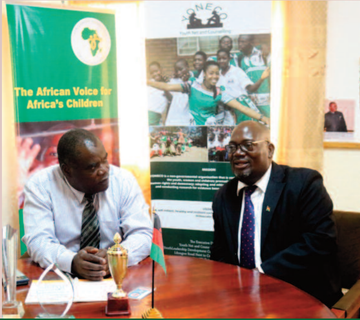
YONECO ED (L) and Zomba DC at YONECO Head Office