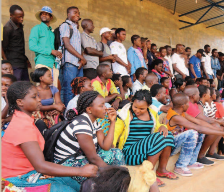
The youth being oriented on human rights

YONECO, in conjunction with Mchinji Police, has pledged to work hand in hand to raise awareness on human rights and responsibilities among primary school learners in the area of Traditional Authority (T/A) Zulu in Mchinji District.