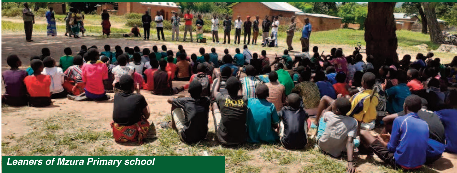
Learners of Mzura Primary school

YONECO conducted a sanitation and hygiene session at Mzura Primary School in Mchinji District with the aim of sensitizing learners about the importance of good sanitation and hygienic practices.