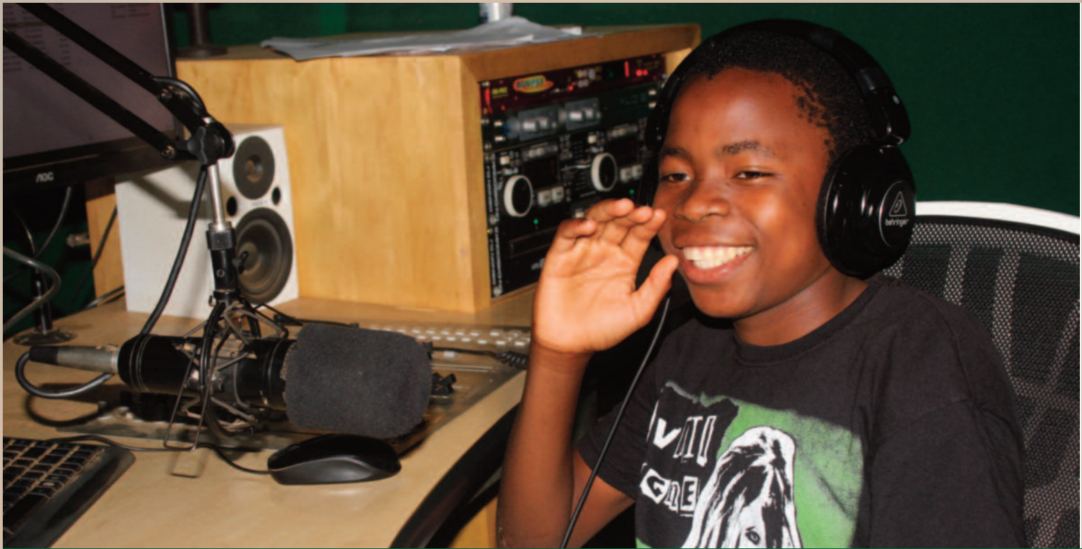
YFM Child Presenter

YONECO FM has increased the number of programmes that are produced by and target children from two to six programmes every week as one way of promoting child participation.