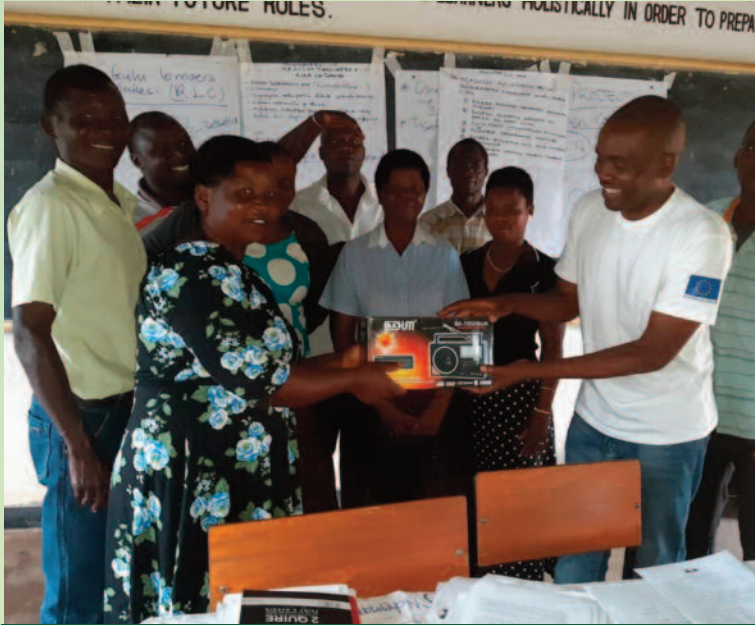
RLC receiving a radio set and audio recorders

YONECO has urged the newly oriented Radio Listening Clubs (RLCs) under Open Contracting project in Mzimba district to take lead in ensuring transparency and accountability on developmental projects being implemented in their communities.