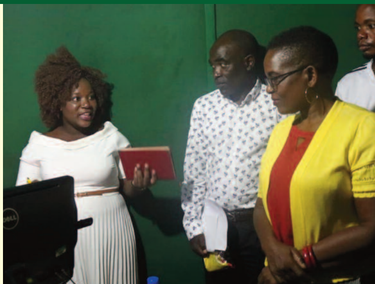
Deputy Station Manager (Left) in the ON-Air studios together with the Officials from the ministry