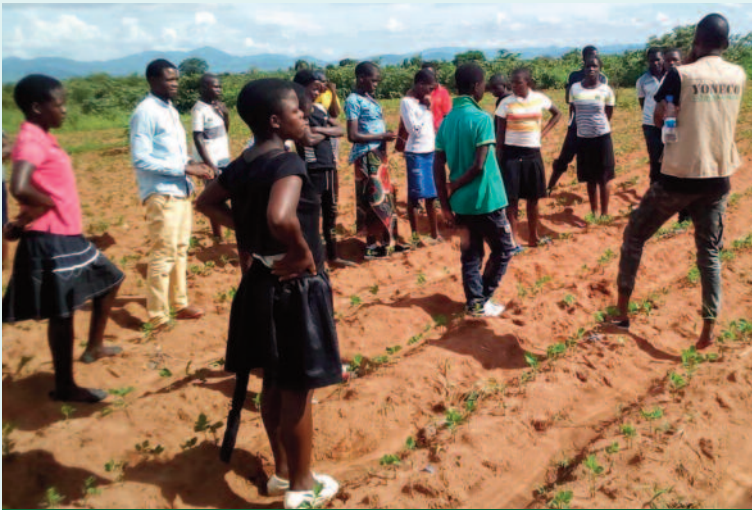
Young people captured during practicals

YONECO facilitated agri-business based activities under the Youth and Agriculture project which started in January 2019, targeting youth groups in the area of Sub-Traditional Authority (STA) Nyaluwanga in Nkhata Bay district.