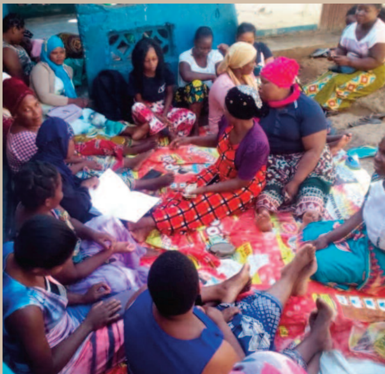
Members of Tigwirizane VSLA

As a way of enhancing women's economic empowerment, YONECO facilitated the establishment of Tigwirizane Village Savings