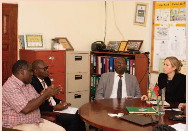
A meeting on TIP in progress

Malawi is a source, transit as well as destination of people who are subjected to this gross human rights violation. As such, internal efforts to respond and curb TIP are very critical and beneficial to many people within and outside the country.