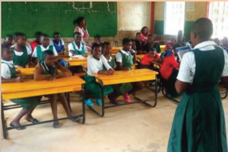
A session on SRHR in progress