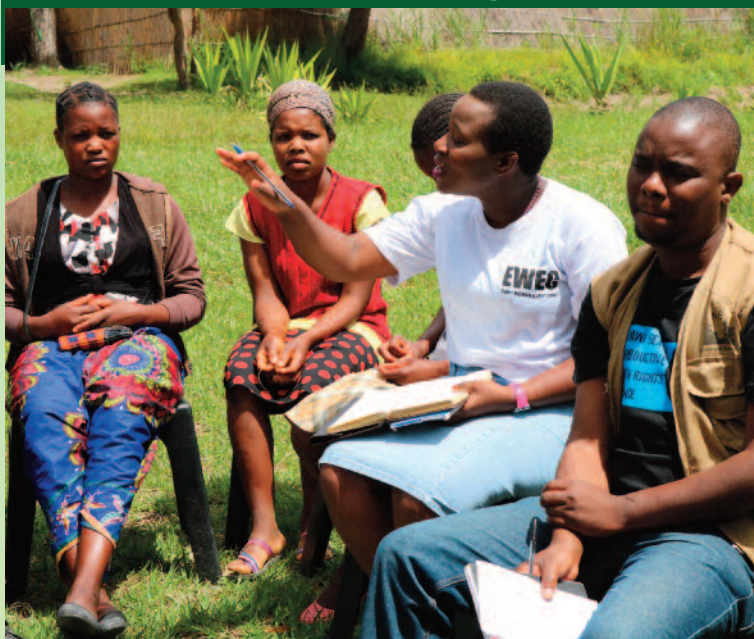
Youth engagement on environmental protection

YONECO has oriented 24 young people on climate smart agriculture as one way of enhancing environmental conservation.