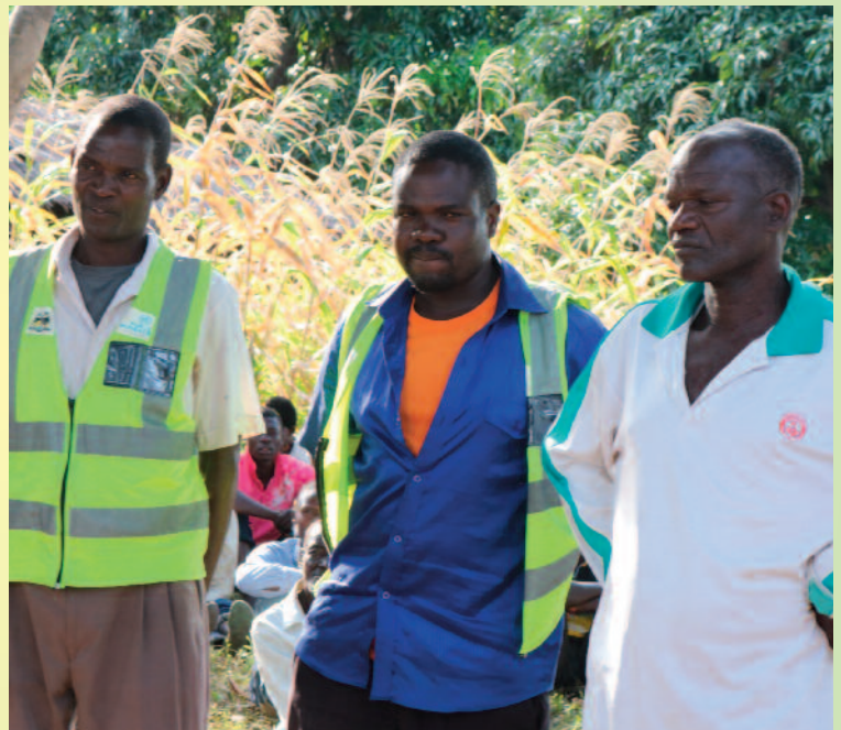
Members of community protection committees

So far, a number of GBV and child abuse cases have been reported to police and community members, through various protection committees follow up on all reported cases.