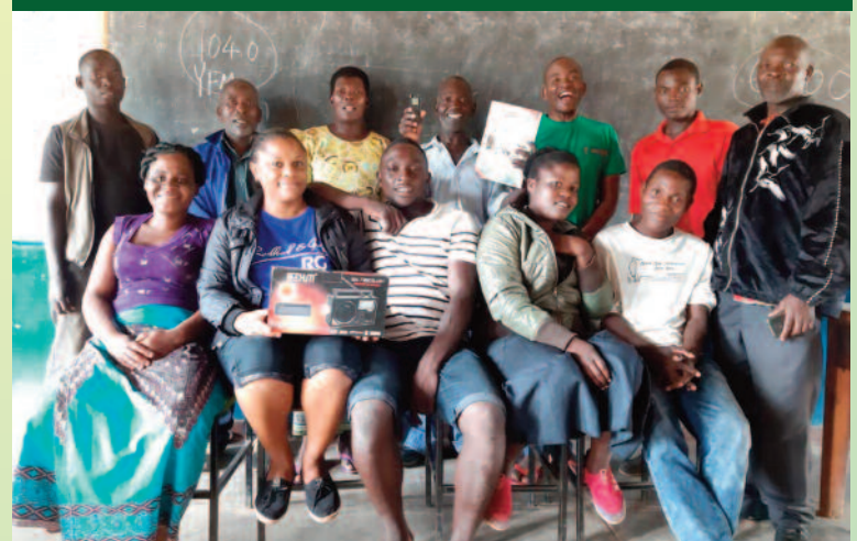
Members of various RLCs after the training