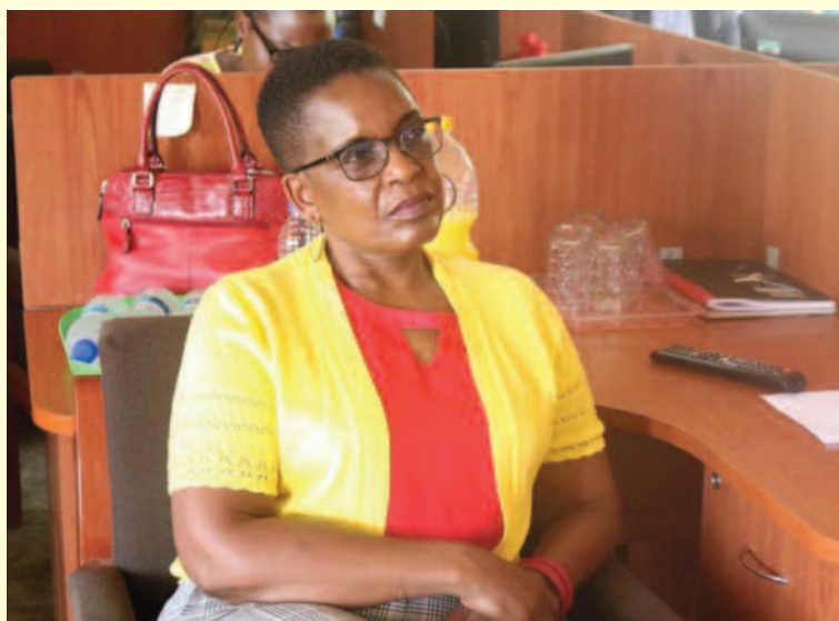
One of the officials of MoCDSW