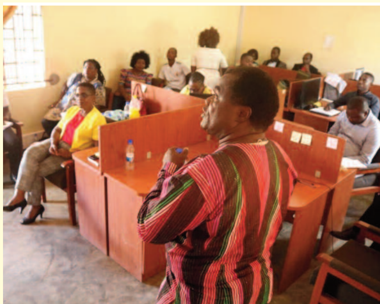
YONECO ED doing a presentation during the tour