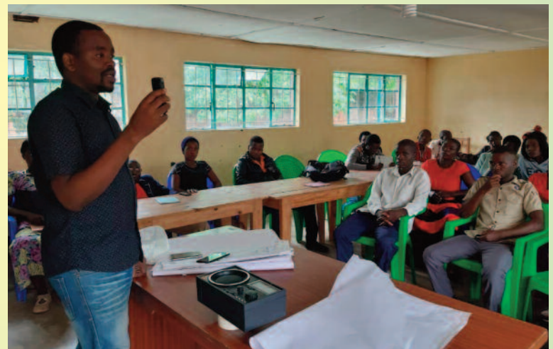
Training of RLCs in progress