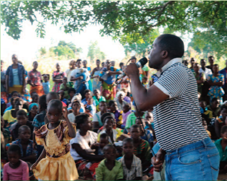
An awareness campaign on GBV in Nkhata Bay

YONECO conducted awareness sessions at Chipazi village in Nkhatabay District as a way of intensifying community action towards ending Gender Based Violence (GBV) and Child Abuse.